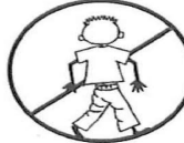
Rear-view- no thanks! Keep your pants pulled up.

1 Cor 6:19-20 Do you not know that your body is a temple of the Holy Spirit, who is in you, whom you have received from God? You are not your own; you were bought at a price. Therefore honor God with your body.