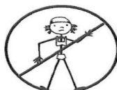
Yeeppers! No bikinis or two-piece swim suits.