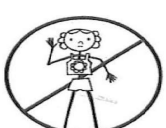
*No spaghetti straps or tank tops, bare midriffs or short shorts!