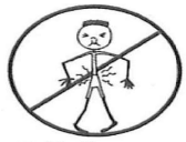
No tight shirts, sweaters, pants, or shorts!