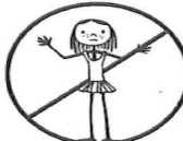
Hey, girls! No short skirts or low cut tops.