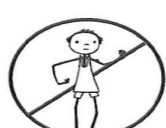
*Please guys, no tank tops or short shorts