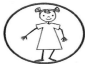
Girls can wear dresses or skirts if they want to. (boys cannot)